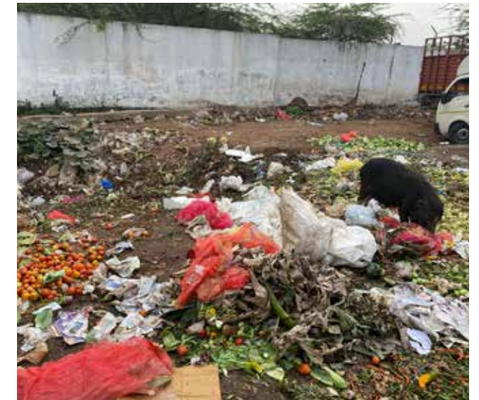
A pig eats discarded tomatoes at the Madanapalle tomato market in Adhra Pradesh, India.

For farmers, harvesting during peak season, from April to July, was associated with less postharvest food loss at the farm and market, compared with harvesting during the off-peak season.