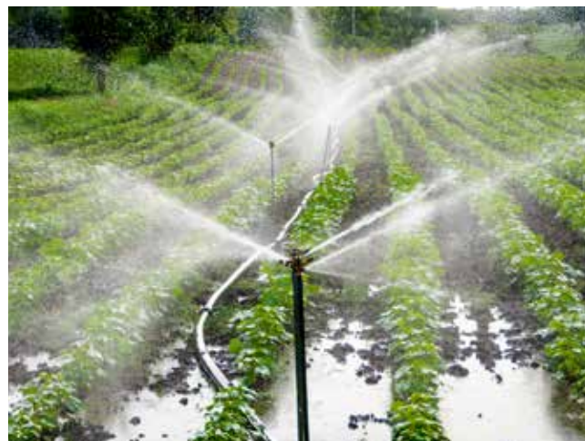
Groundwater irrigation is increasingly important as above-ground water sources dwindle due to climate change.

Rehabilitating water sources contaminated with arsenic is costly, as is adaptation. Water purification methods are limited and often unaffordable for developing countries. Worse, there is a lack of obvious markers for