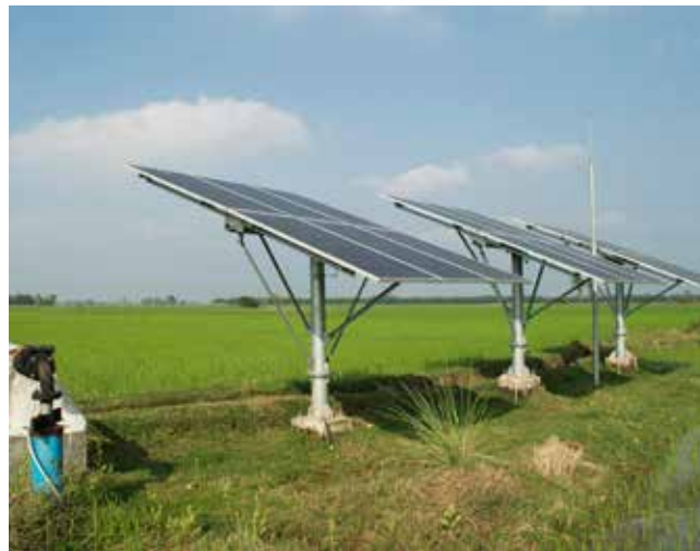
Solar panels power irrigation pumps on a paddy field in West Bengal, India.

As the effects of a warming earth are felt more strongly, the need to curb climate change is coming into conflict with the need to address hunger and malnutrition. Agriculture currently contributes 25% of global greenhouse gases each year, and as the world's population grows, farming's carbon footprint will expand along with it. Simultaneously, rising temperatures and more frequent extreme weather events will threaten agricultural production. To address this dilemma, TCI has embarked on an ambitious initiative aimed at reducing agricultural emissions while meeting increasing nutritional demands.