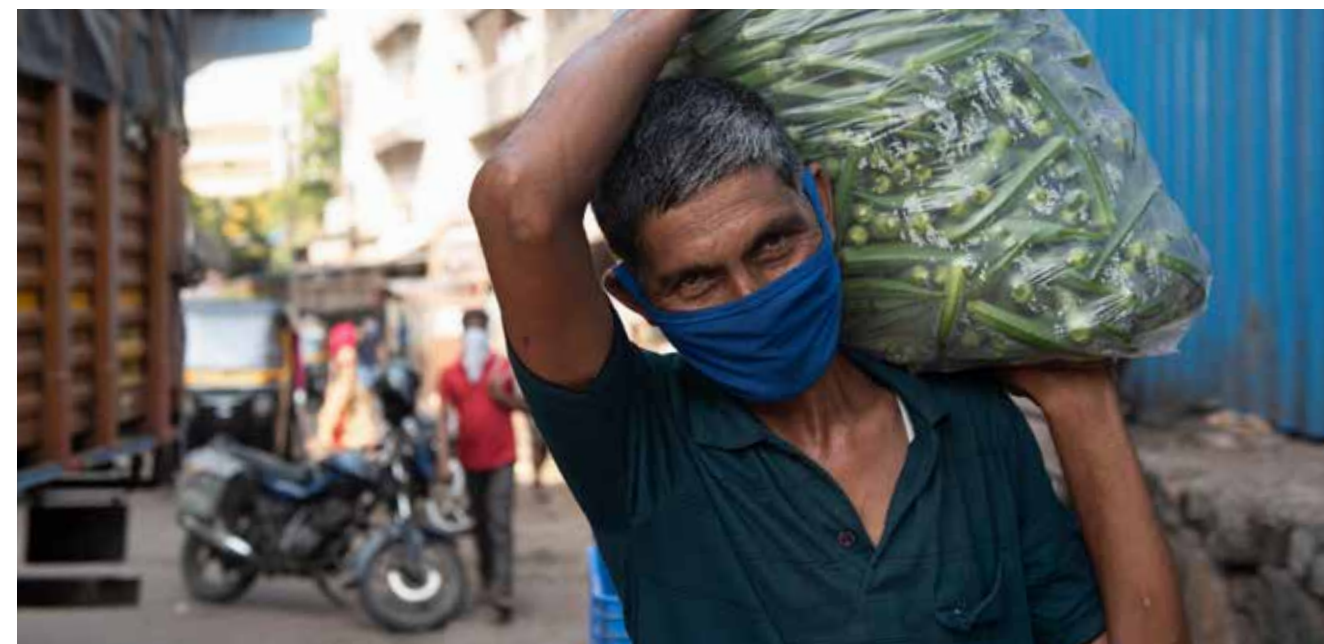
A man wears a face mask while working at a produce market.

Meanwhile, TCI scholars have slowly begun returning to India to conduct research in the field, a key pillar of the TCI program. Yet, in recognition of the continuing threat posed by COVID-19, scholars have changed their research plans in the name of safety.