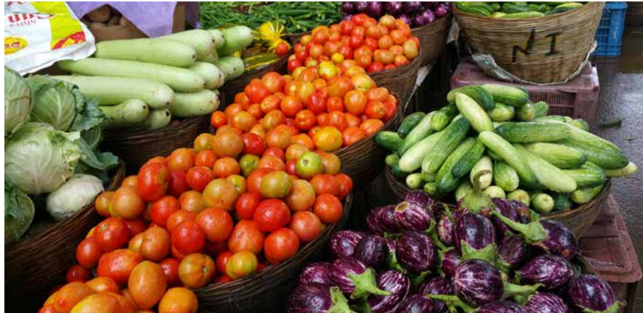
TARINA researchers studied the extent to which market access affects dietary diversity.

contamination levels warranting public health intervention and determined that the risk of contamination varies according to season—information that enables more targeted interventions. Researchers also created an index of household-level risk factors for contamination, such as improper grain storage.