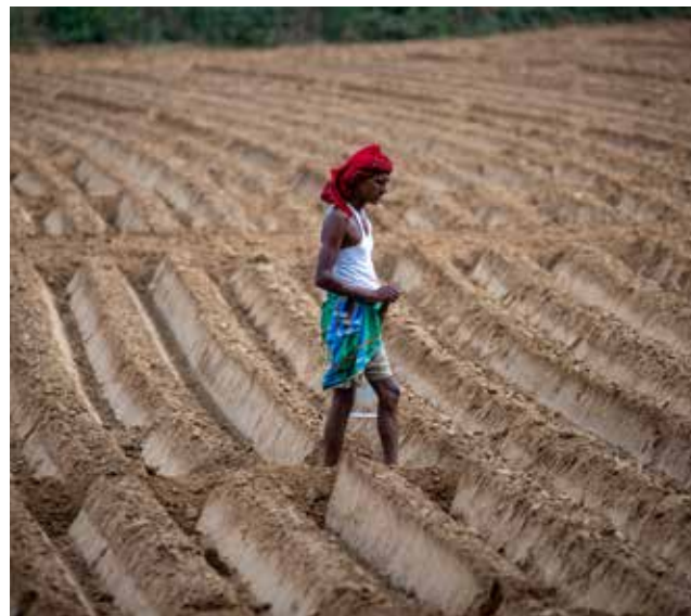
Maintaining healthy soils can improve agricultural productivity.

of soil health (CASH) approach developed at Cornell University to assess the physical, chemical, and biological properties of soil, Krishnan found that reducing tillage and crop residue additions have a positive effect on soil health. However, the effect of crop diversification is not yet clear.