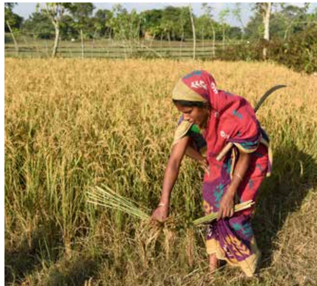
Farmer producer organizations help smallholder farmers to reduce costs and improve market access.

Utilizing an analytical, data-based approach, the FPO Hub will aid in the understanding, development, and promotion of effective farm-aggregation models and serve as a dissemination platform through which stakeholders can access information, technical help, and guidance. A critical part of the Hub is TCI's Database for Indian FPOs, a new