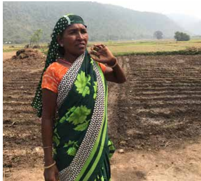
TARINA research developed metrics for measuring women's empowerment in agriculture that were tailored to the Indian context.

As TCI's flagship program from 2015–2020, Technical Assistance and Research in Indian Nutrition and Agriculture (TARINA) undertook a variety of activities aimed at diversifying India's food systems by promoting nutrition-sensitive agricultural interventions, influencing policy to ensure the availability and accessibility of diverse foods, and building capacity for nutrition-sensitive interventions at the local level.