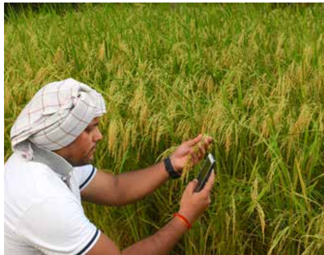
A farmer uses a smartphone app to assess the health of his crop.

The third section examines the stages and extent of food loss and waste at the harvest and postharvest stages and explores how technology can improve storage and transportation facilities to reduce loss, ensure safety, and reduce emissions.