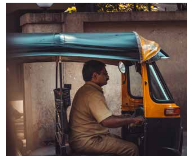
TCI research shows that access to certain types of technology, such as automobiles, is one of the drivers of obesity in Indian men.

In a study published in the journal Economics & Human