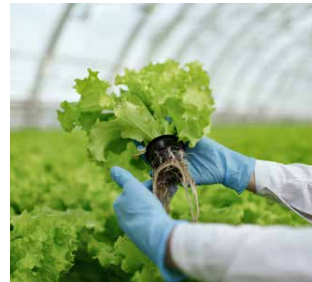
National breeding programs conduct research aimed at genetically improving crops to enhance economic productivity and food security.

The tool was implemented in partnering with national crop improvement programs to measure baseline institutional characteristics that enable innovative interventions. Results of the survey were converted into an index, using a scoring method for evaluation, and ranked to compare breeding programs. Upon project completion,