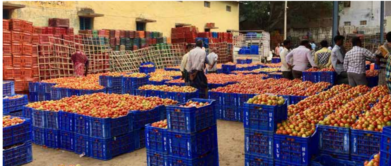
Tomatoes are packed in plastic crates at the Madanapalle tomato market.

desire to increase their profits and ability to invest these profits.