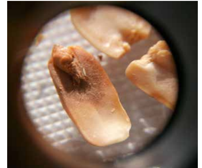
Mycotoxins produced by mold growing on groundnuts and other foods can cause a range of adverse health outcomes.

demonstrated that, while market access is tied to women's dietary diversity, women who are empowered in agriculture are better able to translate their influence into purchases that diversify their diets. This finding is important for