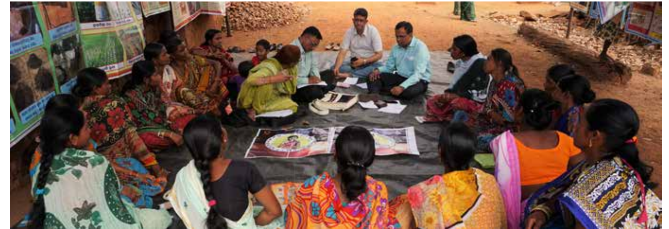
TCI researchers meet with a group of women.

Nutrient absorption is significantly impacted by interrelated factors involving food contamination, access to safe water, and hygiene. TCI research in these areas aims to inform effective interventions that ensure that families and individuals can enjoy the full nutritional benefits of the foods they eat.