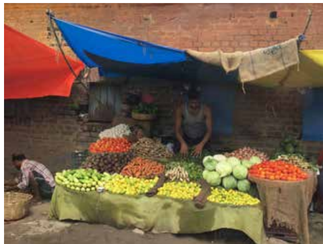
A vendor sells a variety of vegetables at a market in Bihar.

TCI's 2020 report on Food, Agriculture, and Nutrition in India (FAN 2020), with its detailed assessment of the prospects for enhancing productivity and increasing farm income across the country, prompted important conversations on India's efforts to reach zero hunger. One of the lessons from FAN 2020 was the value of conducting the same exercise at a more local level. To that end, TCI is producing a series of state-level reports, starting with Bihar.