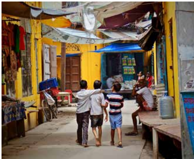
Stunted growth puts children at risk of chronic diseases as adults and can limit educational attainment.

In a two-part study published in Current Science , researchers identified possible contributors to stunting in Karnataka, India, and used the example of relative rainfall to demonstrate how complex interactions between risk factors can increase or decrease the likelihood of stunting at the local level.